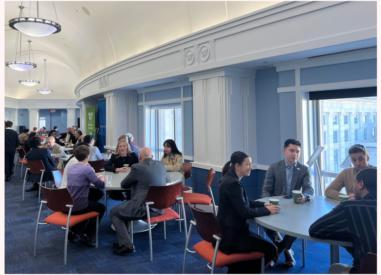
Intern Meet & Greet