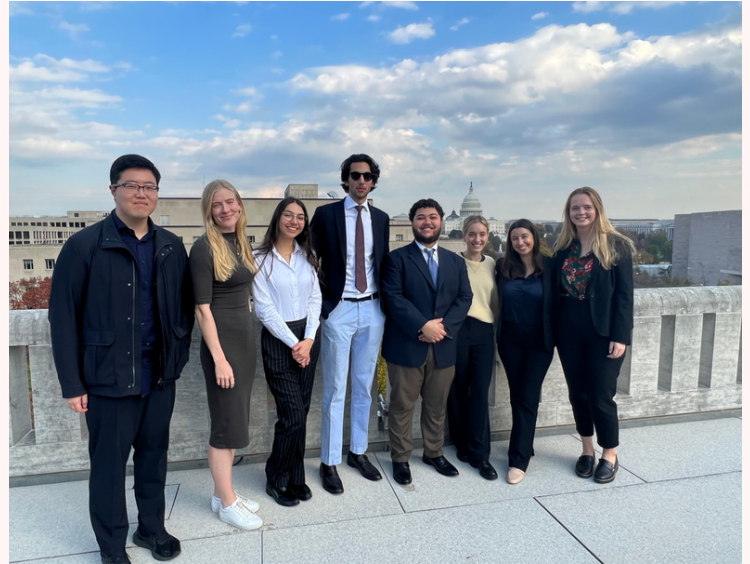
Visit to the Canadian Embassy