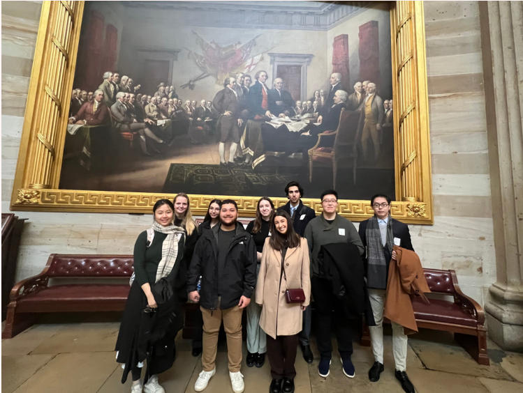
Tour of the US Capitol