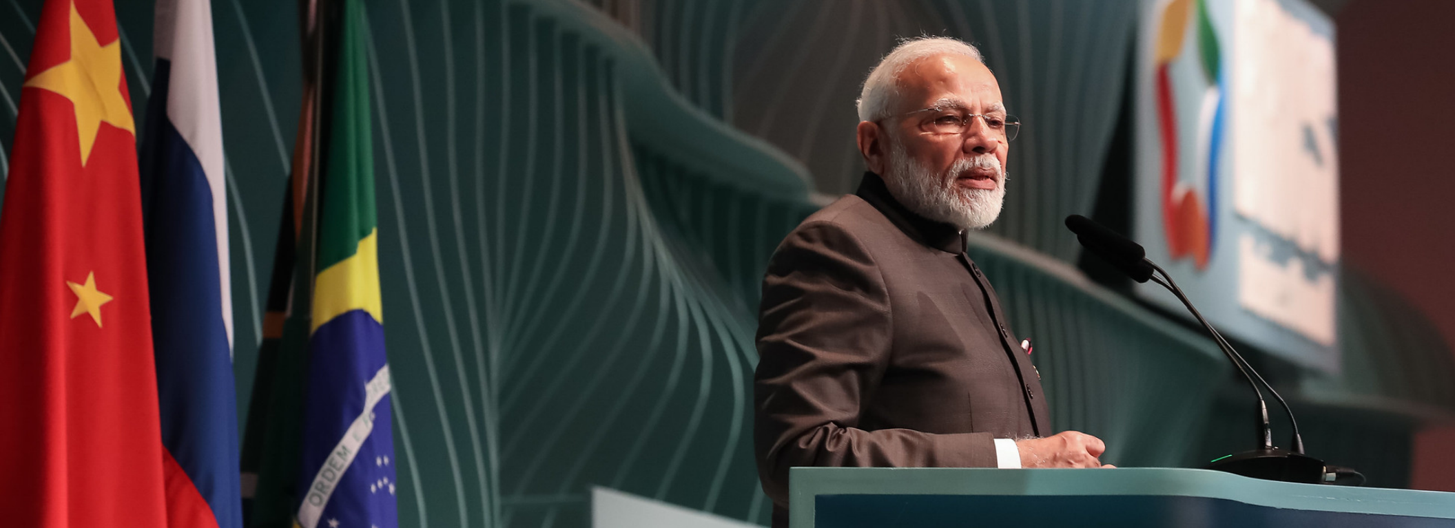
Image: Remarks by the Prime Minister Narendra Modi of India during the closing ceremony of the BRICS Business Forum, 2019.