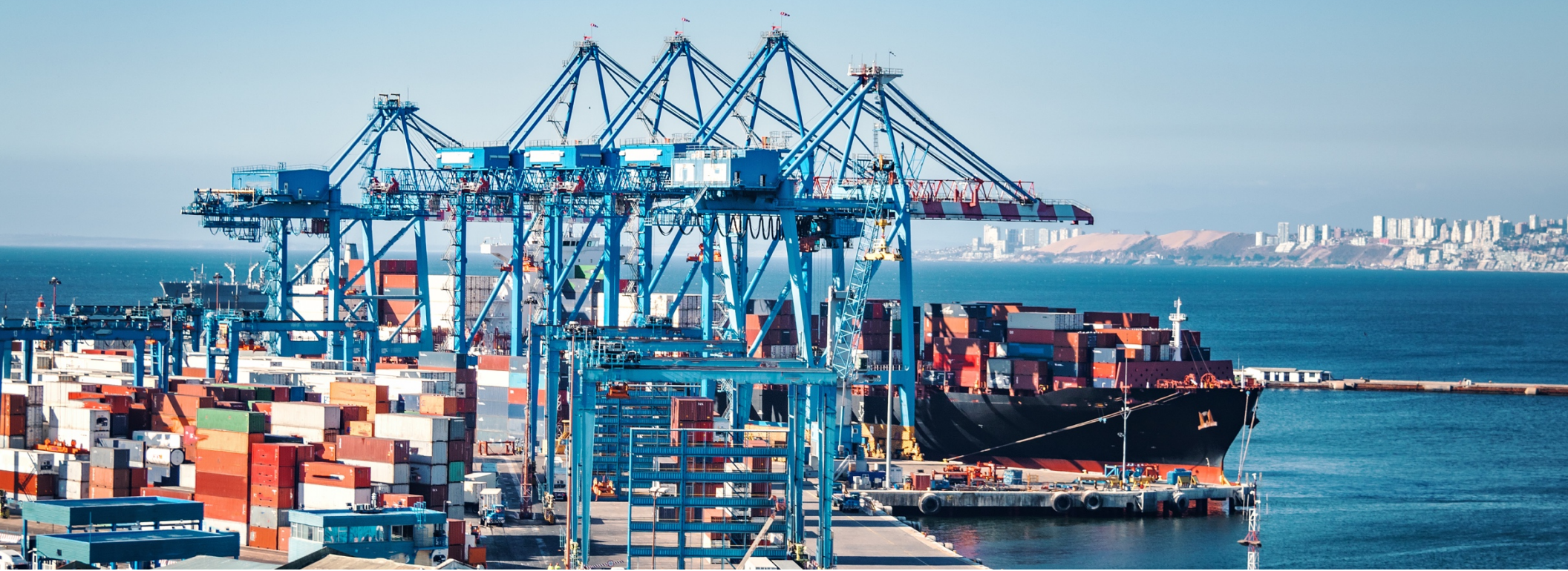
Image: Valparaiso Harbor, Valparaiso, Chile.

Besides adding value to Latin America’s service sector by creating jobs, Indian IT and ITeS companies also play a role in the services trade. India’s bilateral trade in services with the Latin American region stood at $13.4 billion in 2019, with exports of $8.2 billion and imports of $5.2 billion, 29 the large majority of which is trade in IT and other business services, which companies like TCS, Infosys, Tech Mahindra, and Wipro specialize in. Indian IT and ITeS companies can collaborate more with Latin American government institutions to digitize and modernize their business processes, and the Indian government should also consider signing more social security agreements (such as the one signed with Brazil, which makes it easier for Indian companies abroad to manage payroll and tax regulations, including social security benefits and pensions) and agreements to avoid double taxation in services.