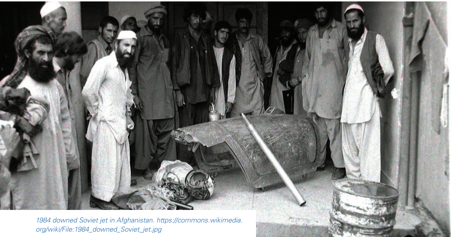
1984 downed Soviet jet in Afghanistan.

In February 1980, after the USSR invasion of Afghanistan, the KGB sought to destabilize neighboring Pakistan as it grew closer diplomatically to the U.S. Disinformation campaigns were distributed in Islamabad and Karachi via leaflets denouncing government policies from alleged insiders, throughout Pakistani press outlets decrying military mobilizing, and in India in an attempt to isolate Pakistan from potential allies (Cull et al, 2017). Service A was notorious for devising conspiracy theories as well—circulating stories in foreign Soviet-financed newspapers that fostered anti-Americanism abroad. Some notable examples of these rumors include claims that the U.S. genetically engineered the AIDS virus to target black populations and gay men in the 1980s and a separate rumor alleging that the U.S. was behind the attempted assassination of Pope John Paul II in 1981 (Schoen & Lamb, 2012).