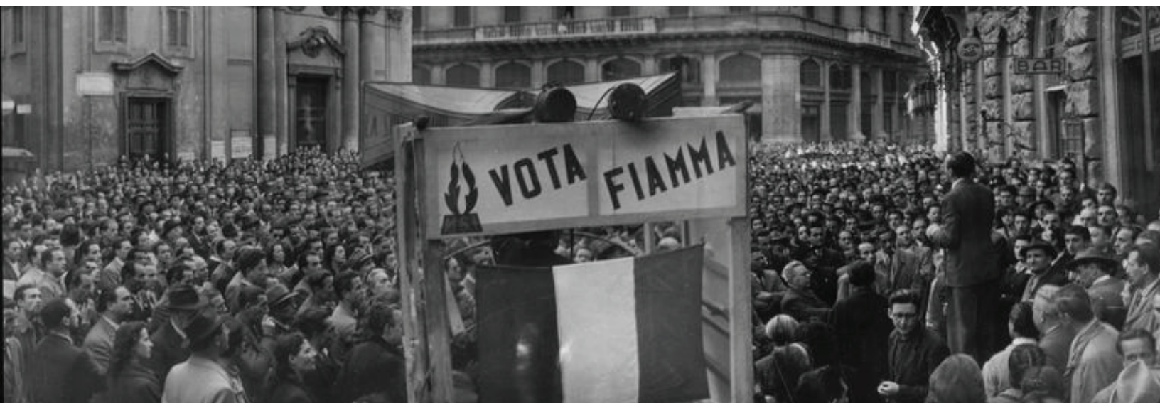
The 1948 Italian elections were described at the time as no less than an “apocalyptic test of strength between communism and democracy.”

Most of the election interference activity was not, as common knowledge suggests, undertaken within the same elections (Levin, 2016). The U.S. and the Soviet Union only backed opposing sides in the same election in 8 percent of cases (Levin, 2016, p.98). For the most part, both countries intervened independent of any concrete confirmation that the other was already involved in the election (Levin, 2016). Occasions where the U.S. and the Soviet Union backed different sides in the same election, such as the Italian elections in 1948 and the Chilean election in 1970, were not the norm (Levin, 2016). This contradicts popular historical narratives that the superpowers only interfered to directly prevent the other from gaining influence; instead it is likely that the competitive climate motivated the two countries to seek influence in foreign countries as part of overall geopolitics, rather than the direct threat of their opponent's presence. Ideological competition and expansion characterized the Cold War and motivated the use of covert tactics that affect public opinion and political sentiments, such as disinformation campaigns.