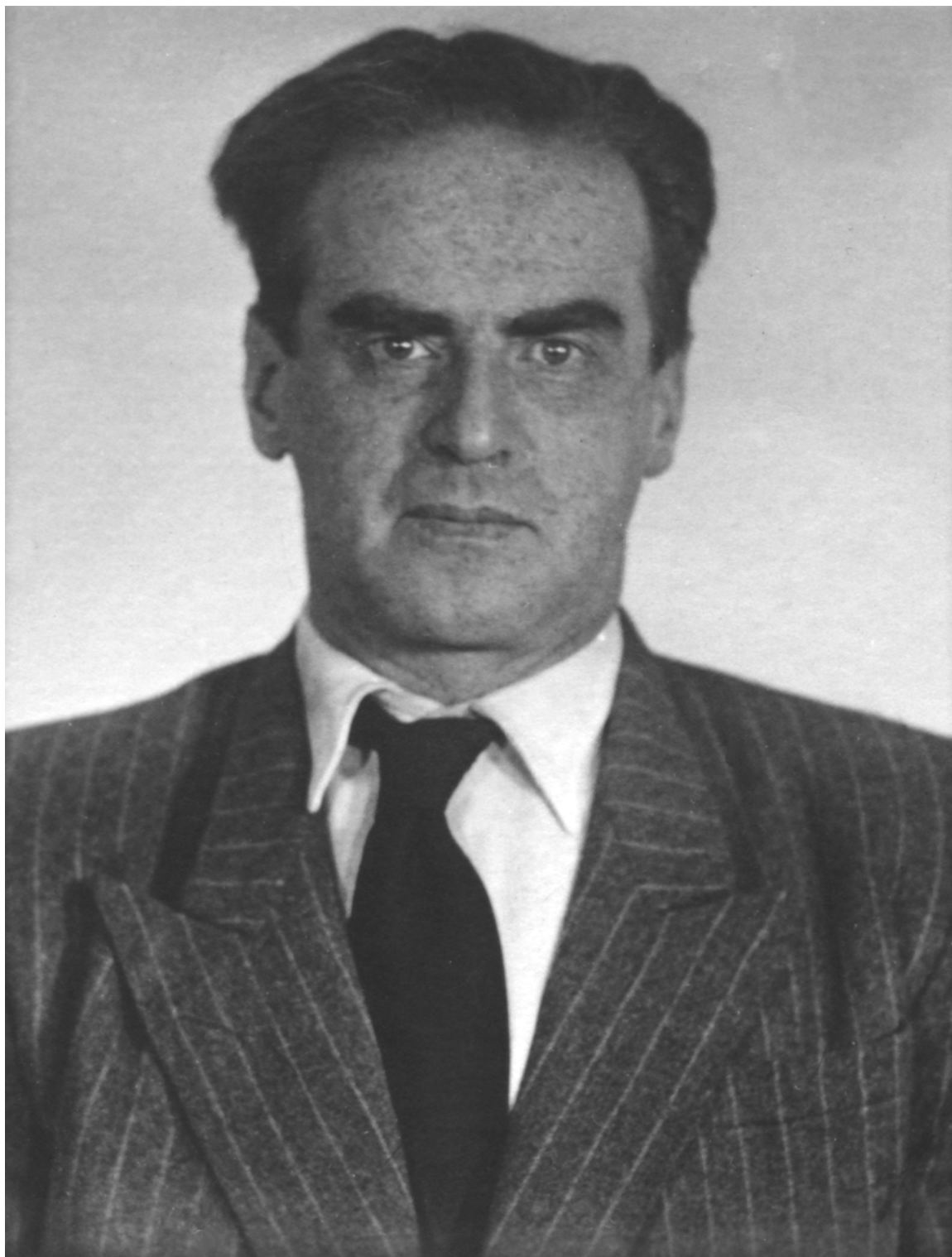
Photograph Appendix Figure 1: Rudolf Slansky