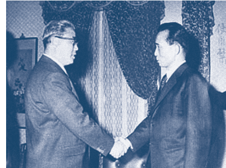
PAK SEONGCHEOL AND PARK CHUNG HEE

So previous to these two developments, neither of the two Koreas had come up with any comprehensive unification policies, so there had been no room for the two sides to talk about unification per se. Instead, the North Koreans kept on being aggressive and proactive, talking about certain conditions for unification in the context of political negotiations and things like that, or certain conditions that North Korea imposed on South Korea allegedly for the purpose of creating condi-