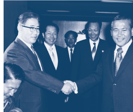
PAK SEONGCEHOL AND LEE HURAK