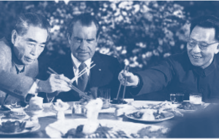
ZHOU ENLAI AND RICHARD NIXON

on their own, independent of international events, or were they influenced by international events?