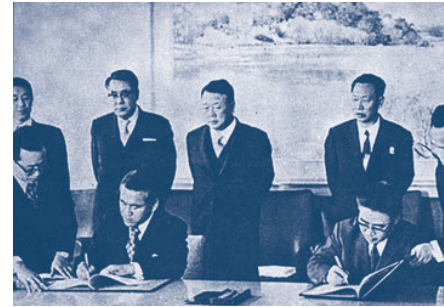
SIGNING CEREMONY FOR JULY 4 DECLARATION