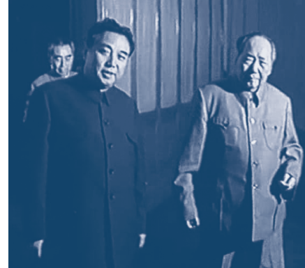
KIM IL SUNG AND MAO ZEDONG