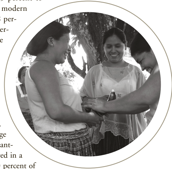
At the mobile education center, women demonstrate how to use a condom

The integrated DHS has been a critical part of developing ProPetén's programs linking health and population with the environment. In addition to