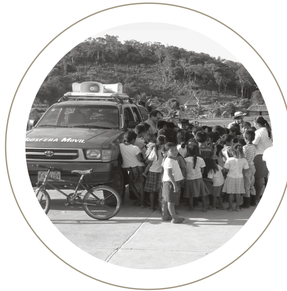
School children flock to the Mobile Biosphere when it arrives in their village in northern Petén

Qualitative research: Integrated research often calls for qualitative data and analysis, which can help move reproductive health programs beyond the limitations of "objective metric measures." As Schwartz (2004) has argued, some projects may have failed