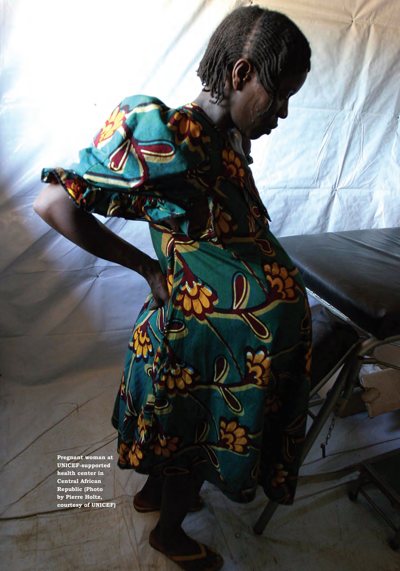
Pregnant woman at UNICEF-supported health center in Central African Republic