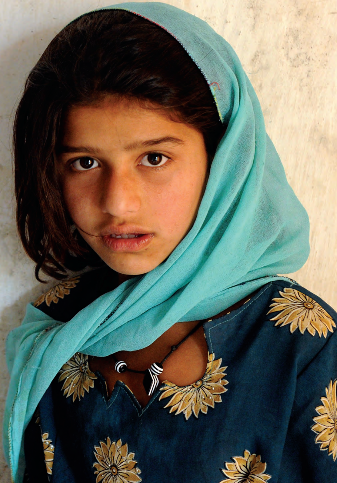
Young woman in Afghanistan