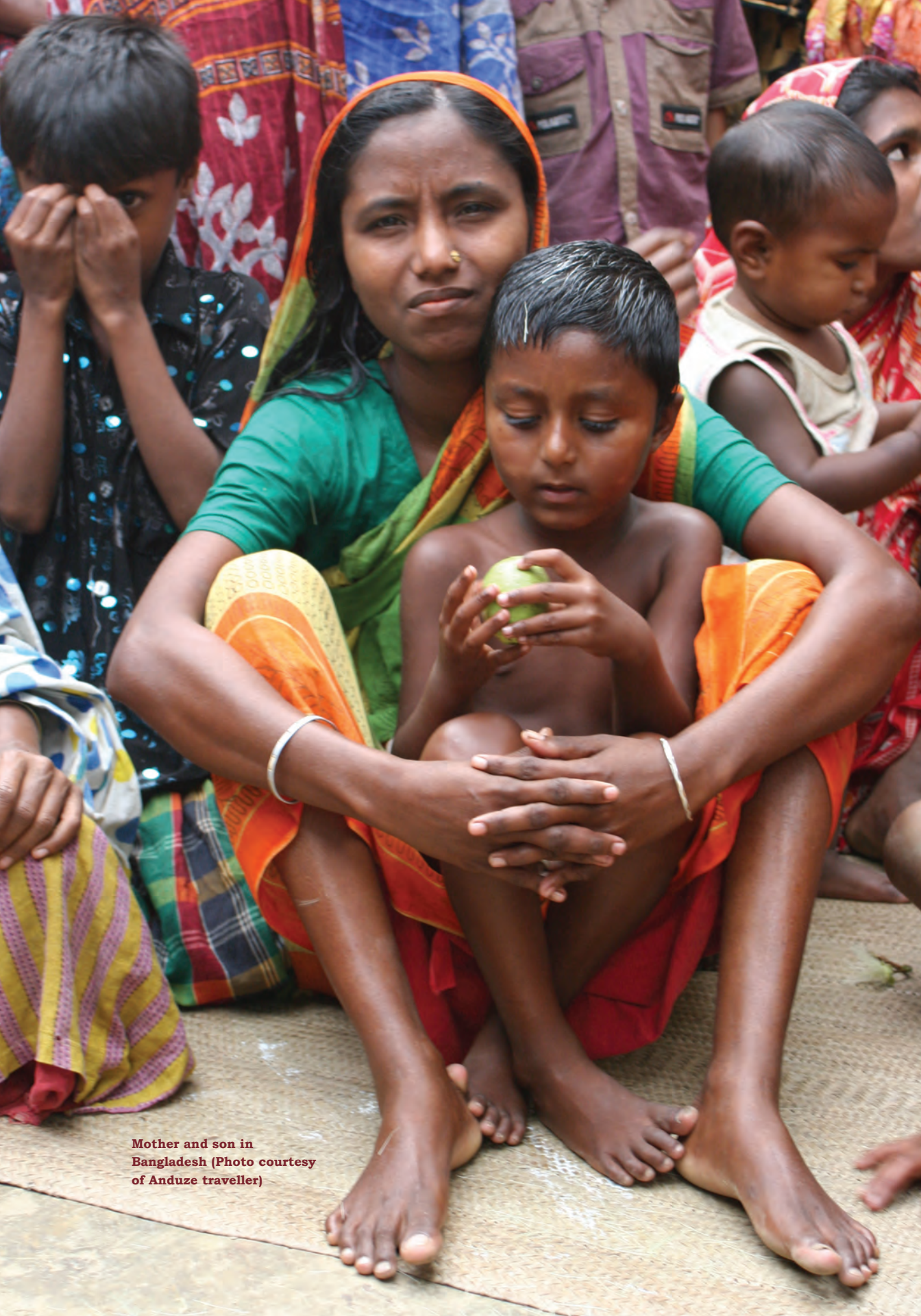
Mother and son in Bangladesh