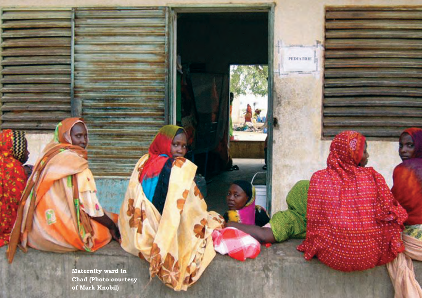
Maternity ward in Chad

“We know how to save women’s lives, we don’t need a cure...this is a political problem and political will is essential.”