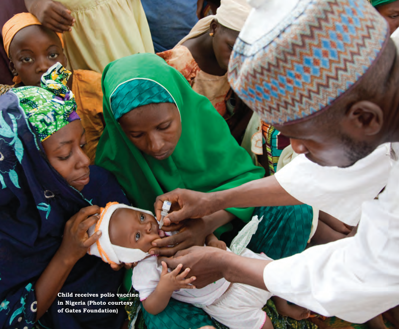
Child receives polio vaccine in Nigeria

“Faith-inspired organizations have many different opportunities. The point that is often reiterated is that religions are sustainable. They will be there before the NGOs get there and will be there long after.”