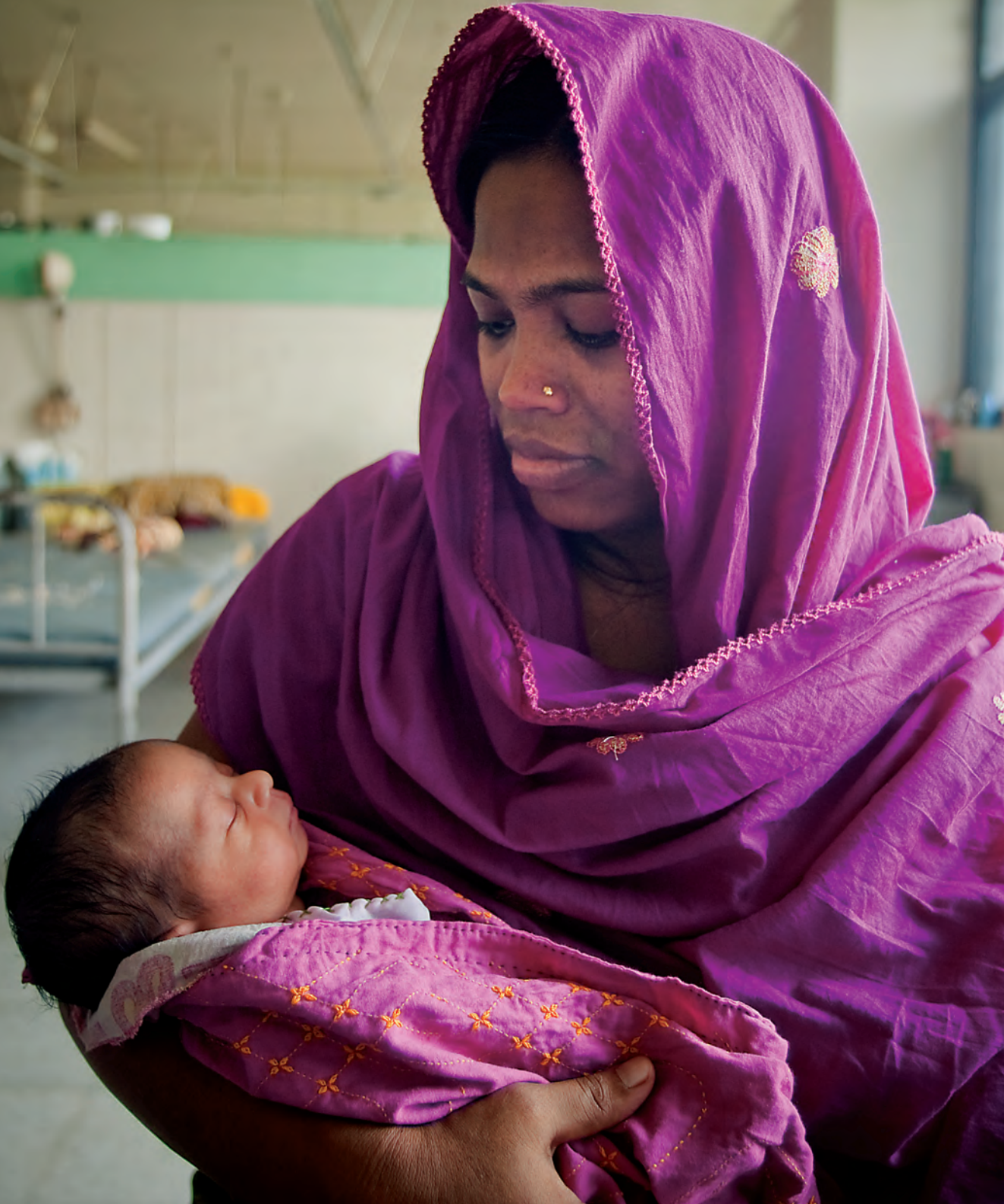
Mother and newborn at Maternal & Child Health Training Institute in Bangladesh