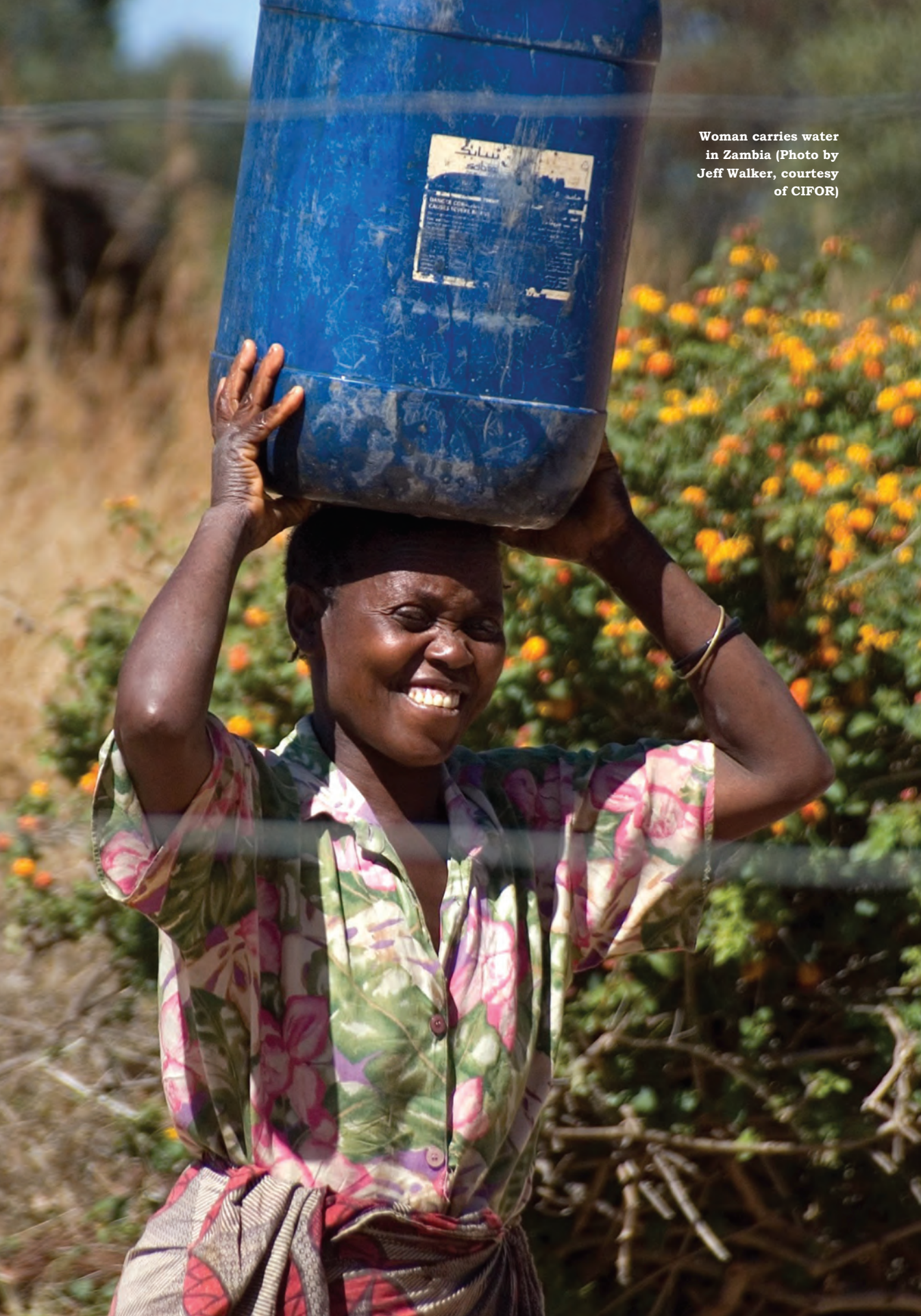
Woman carries water in Zambia