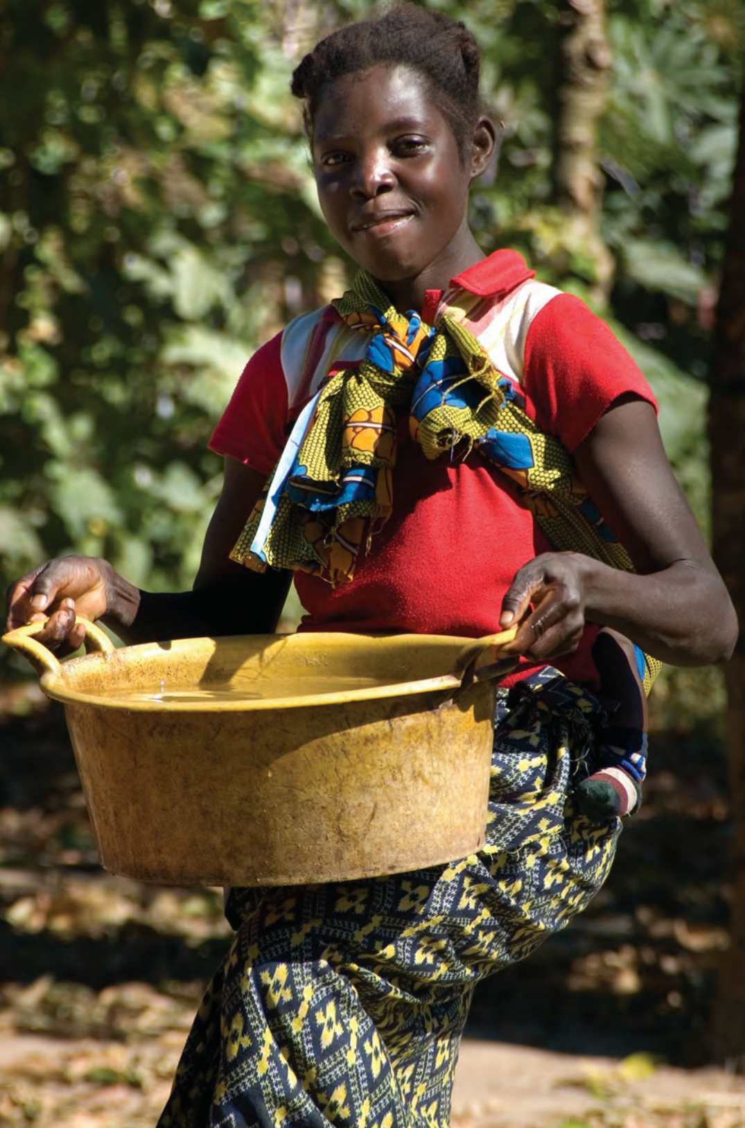
Young woman carrying water in Zambia