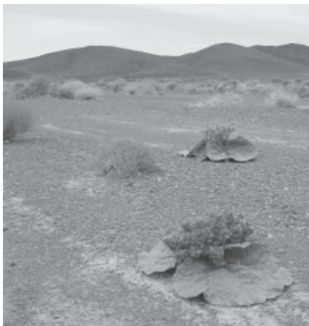
The Anxi nature reserve