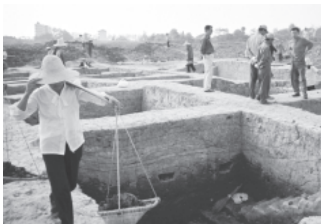
Cultural heritage rescue excavations and archaeological dig in Chuzhou, Anhui Province. These are the remains of a 3,000-year old site unearthed during West-East pipeline construction.

Leveraging international expertise. Use of acknowledged international environmental experts can