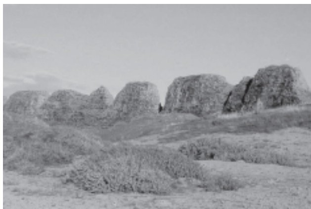
Great Wall in Gansu Province. The earthen structure has been heavily weathered due to the harsh climate

The pipeline crosses the Great Wall in twelve locations in Gansu, Ningxia, Shaanxi, and Shanxi provinces. Crossing points are defined as including sites at which both visible aboveground sections of the wall