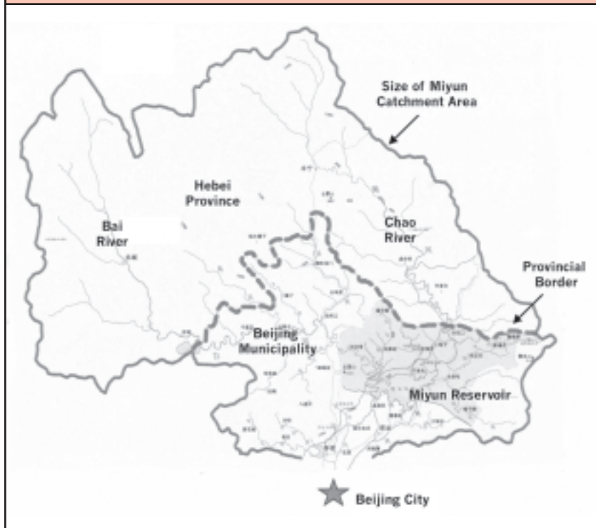
Map 1. Catchment of Miyun Reservoir

nitrate and residues to be dumped in the reservoir. By 2002, while only 1,080 cages owned by 80 fish farmers were left, they had increased production, which led to a yearly output of about 3,500 tons of fish and approximately 4,000 tons of waste (Yu Zhimin, 2003). Only in 2003 did the Beijing government issue a regulation prohibiting cage fish farming in the Miyun reservoir. 8 (In the weeks thereafter, consuming fish was jokingly called a “patriotic” diet). However, this does not necessarily mean that fish farming in the reservoir and its vicinity has been totally abandoned.