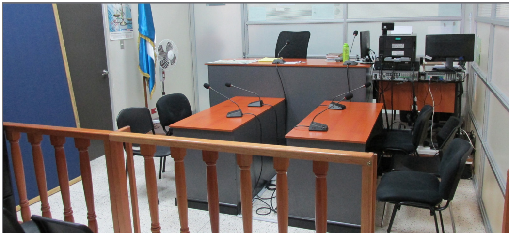
Judges in the 24-hour women's court can quickly issue an injunction or an arrest warrant (if the aggressor's identity is known).

This specialized court also features an antechamber where psychologists, prompted by judges, can interview children and victims. These interactions can be video-conferenced onto a large screen in the courtroom during a trial, or recorded beforehand and submitted into evidence. The witness's identity may or may not be concealed from the accused, depending on the case, but the idea is to avoid exposing a vulnerable victim to a hostile courtroom environment. The United States no longer funds any of these 24-hour courts; Guatemala has assumed that responsibility.