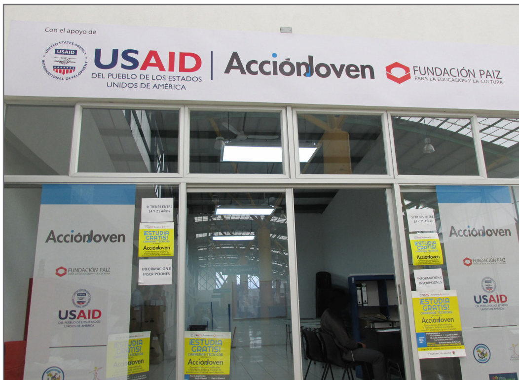
Acción Joven, situated in Centra Sur and funded by CARSI, is now offering nearby youths vocational training in areas like electronics, cooking and construction, in addition to artistic and sports activities.

The U.S. mission in Guatemala has already crafted its own goals, tailored specifically to its host country. When these Guatemala-specific goals fit inside CARSI’s general goals, the embassy can dip into the CARSI fund to pursue them. “CARSI, for us, is a budget line item,” said one USAID official in Guatemala City. “We see it as part of a portfolio of funds that we use depending on what programs need funding and when.” In other words, she added: “We don’t go out and say, ‘These are CARSI programs.’ We say, ‘These are USAID programs.’” 102 INL operates the same way.