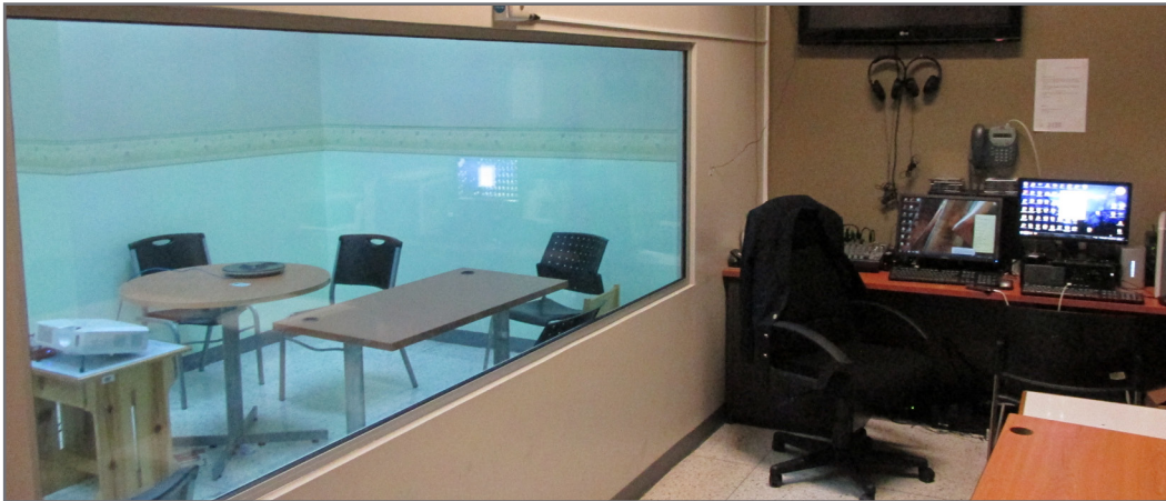
In this secure antechamber, crime victims and witnesses can give testimony on camera without being intimidated by the accused. This too was constructed with CARSI money.

ing in Guatemala City. Once a victim walks into the court, she can file a complaint in a private office, and also seek any necessary medical attention (including a rape kit). Psychologists and social workers are on hand to help. Judges can authorize a protection injunction and issue an arrest warrant if the aggressor's identity is known.