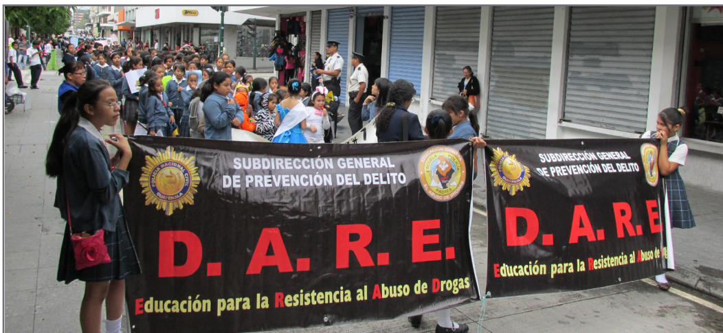
Children march in a school parade in Zona 1 of the capital on June 29, 2014.

A third INL strategy is material and logistics support. When the PNC executes a week-long poppy eradication campaign in San Marcos, INL provides food and portable toilets. When officers give DARE or GREAT courses, INL gives them projectors, laptops, and manuals. INL helped set up the Sistema de Información Policial (SIPOL, or Police Information System), which is a computerized crime analysis system that helps pinpoint criminal hot spots. 131 Since 2003, INL has provided the model precinct in Villa Nueva with computers, wiretapping/surveillance equipment, and telephones.