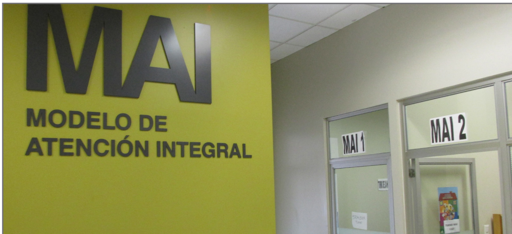
Here in the Public Ministry’s headquarters in Zona 1 of Guatemala City, female crime victims can get legal, psychological, and medical assistance 24 hours a day. This facility was built with CARSI funds.

In 2006, USAID proposed a 24-hour court that would operate around-the-clock with judges, police, prosecutors, and defenders all “co-located,” or assigned space, in the building. USAID furnished the design and monitored operations for two years. The difference was stark: inmates saw a judge much quicker, and in Guatemala City, the rate of dismissals fell from 77 percent to 12 percent. The 24-hour courts were so successful that between 2007 and 2009, four new ones were opened in Villa Nueva, Mixco, Escuintla, and Sacatepequez. (A fifth is now in the works for Xela, Guatemala’s second-largest city; USAID is currently monitoring these courts to see if adjustments are necessary.) 121