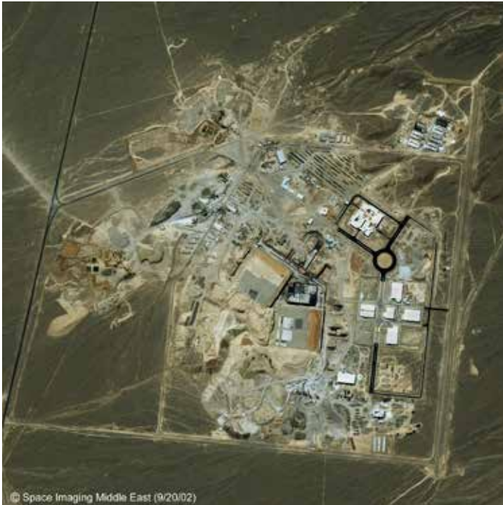
Iran's uranium enrichment facility at Natanz (aerial view)

the materials to] construct” a weapon from Iran. By negotiating a landmark agreement that significantly limits Iran’s nuclear capabilities for an extended period, the United States has achieved a form of deterrence by denial.