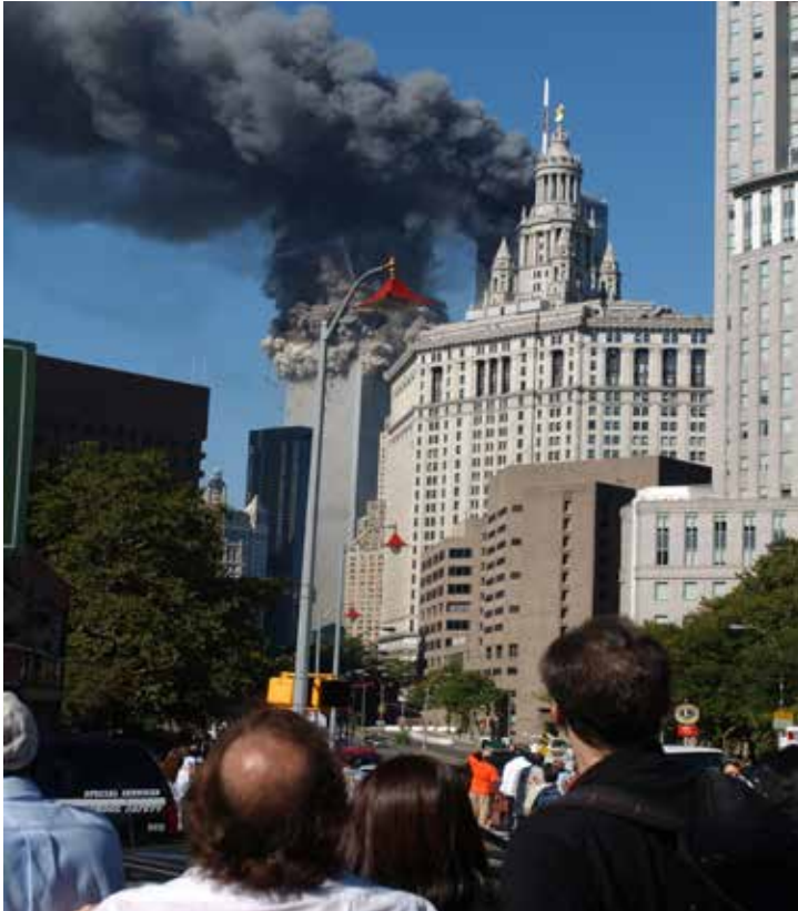
Crowd witnesses South Tower of the World Trade Center collapsing as a result of terrorist attack while North Tower burns on September 11, 2001 at 9:59 am in New York.

The redefinition of threat precipitated a major shift in strategy. The Bush administration asserted that the Cold War concepts of containment and deterrence were “less likely to work against leaders of rogue states [who are] more willing to take risks” and more prone than an orthodox great power rival (such as the Soviet Union or contemporary China) to use weapons of mass destruction. 18 The 2002 National Security Strategy elevated the use of force, as “a matter of common sense and self-defense,” not only preemptively , against imminent threats (a usage consistent with international law), but also preventively , against