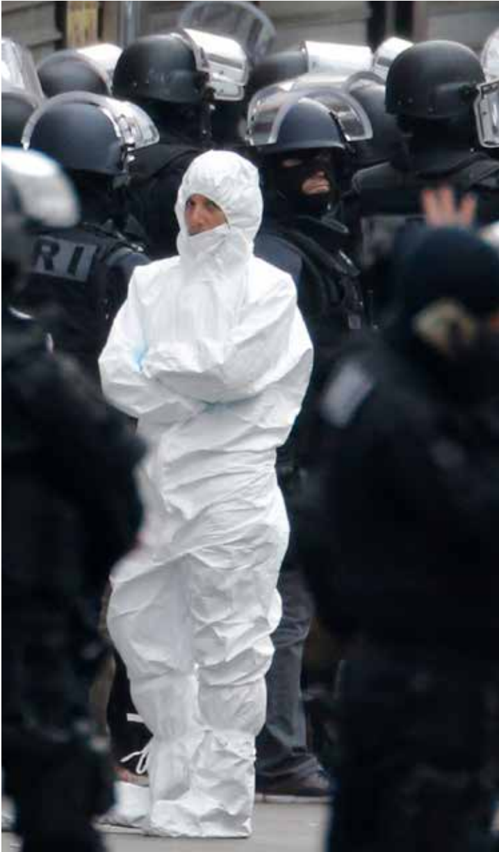
Members of French special police forces of the Research and Intervention Brigade (BRI) and forensic experts are seen in a raid zone in Saint-Denis, near Paris, France, after the November 13, 2015 terrorist attacks in the French capital.