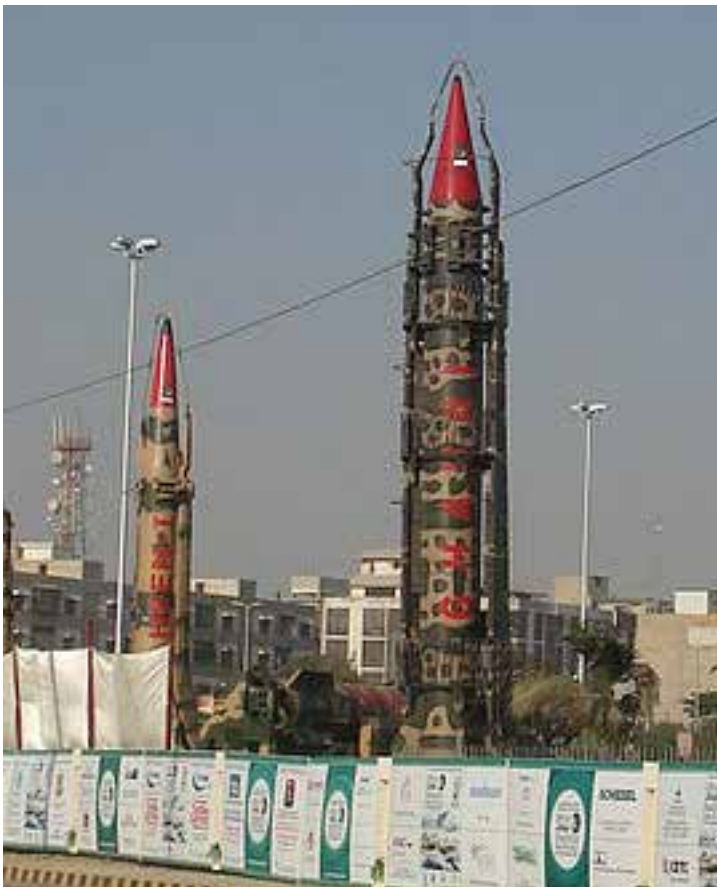
Above: Pakistani missiles on display in Karachi.

in Afghanistan trumped nonproliferation interests. With the United States ramping down its involvement in Afghanistan and Pakistan ramping up its nuclear capabilities, these priorities have been shifting. But getting leverage on Pakistan's nuclear challenge will require addressing the broader geostrategic environment—that is, harnessing what should be China's and India's shared interests in forestalling a nuclear breakout in a fragile state on their borders.