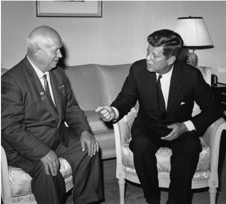
June 3, 1961: Soviet Premier Nikita Khrushchev, left, and U.S. President John F. Kennedy

to the contemporary “rogue state” threat. Whether or not the traditional assumption about nuclear weapons being acquired and controlled exclusively by states will continue to hold will be examined in the following section on the evolving urgent threat posed by non-state terrorist groups.